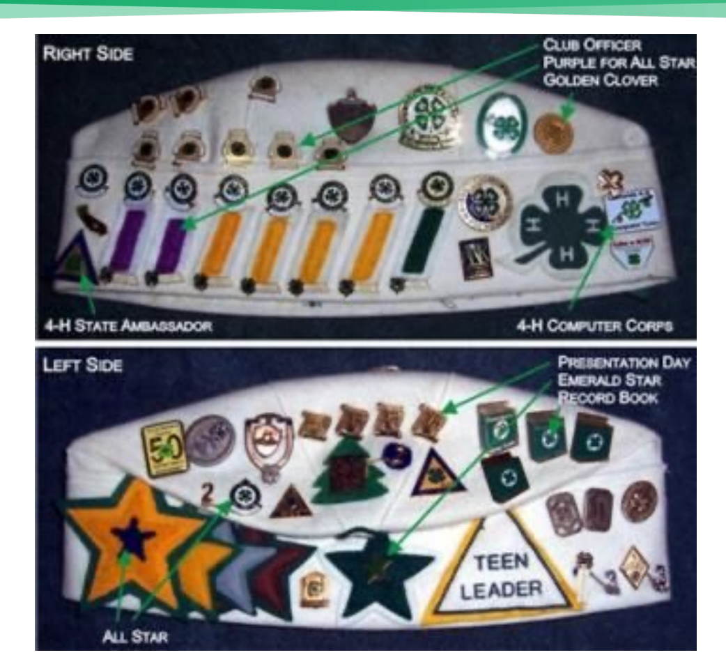
*Please note that the white hat is no longer used. All hats are green for all age levels.